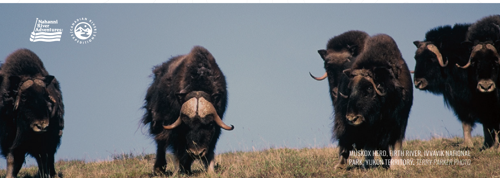
MUSKOX HERD, FIRTH RIVER, IVVAVIK NATIONAL PARK, YUKON TERRITORY.