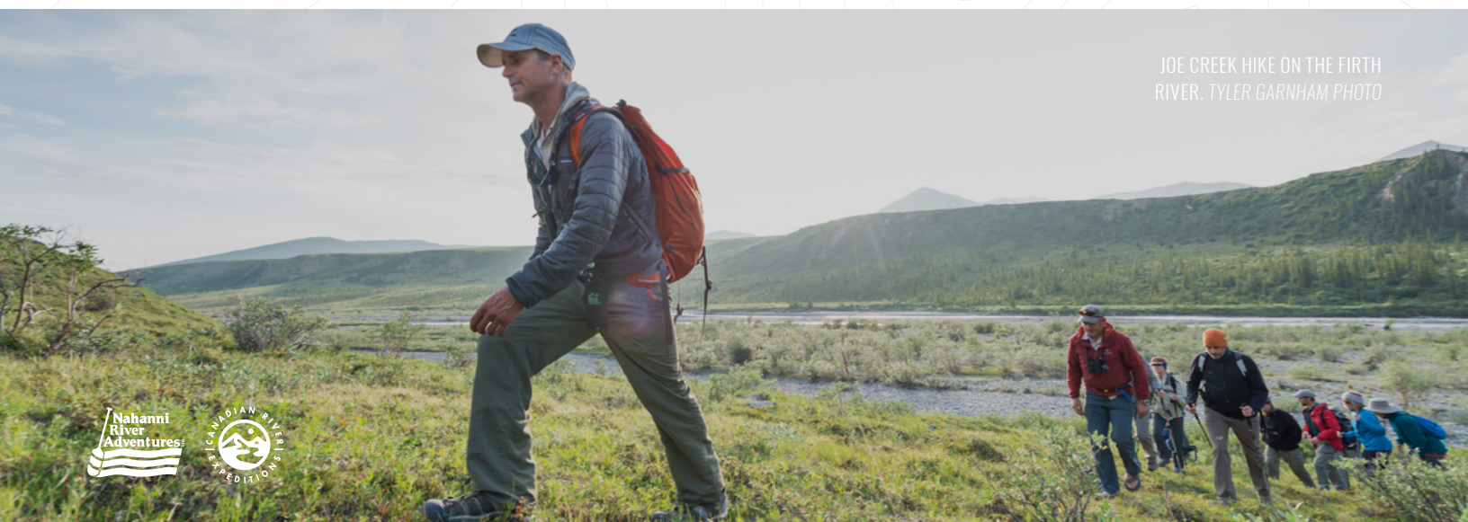
JOE CREEK HIKE ON THE FIRTH RIVER.