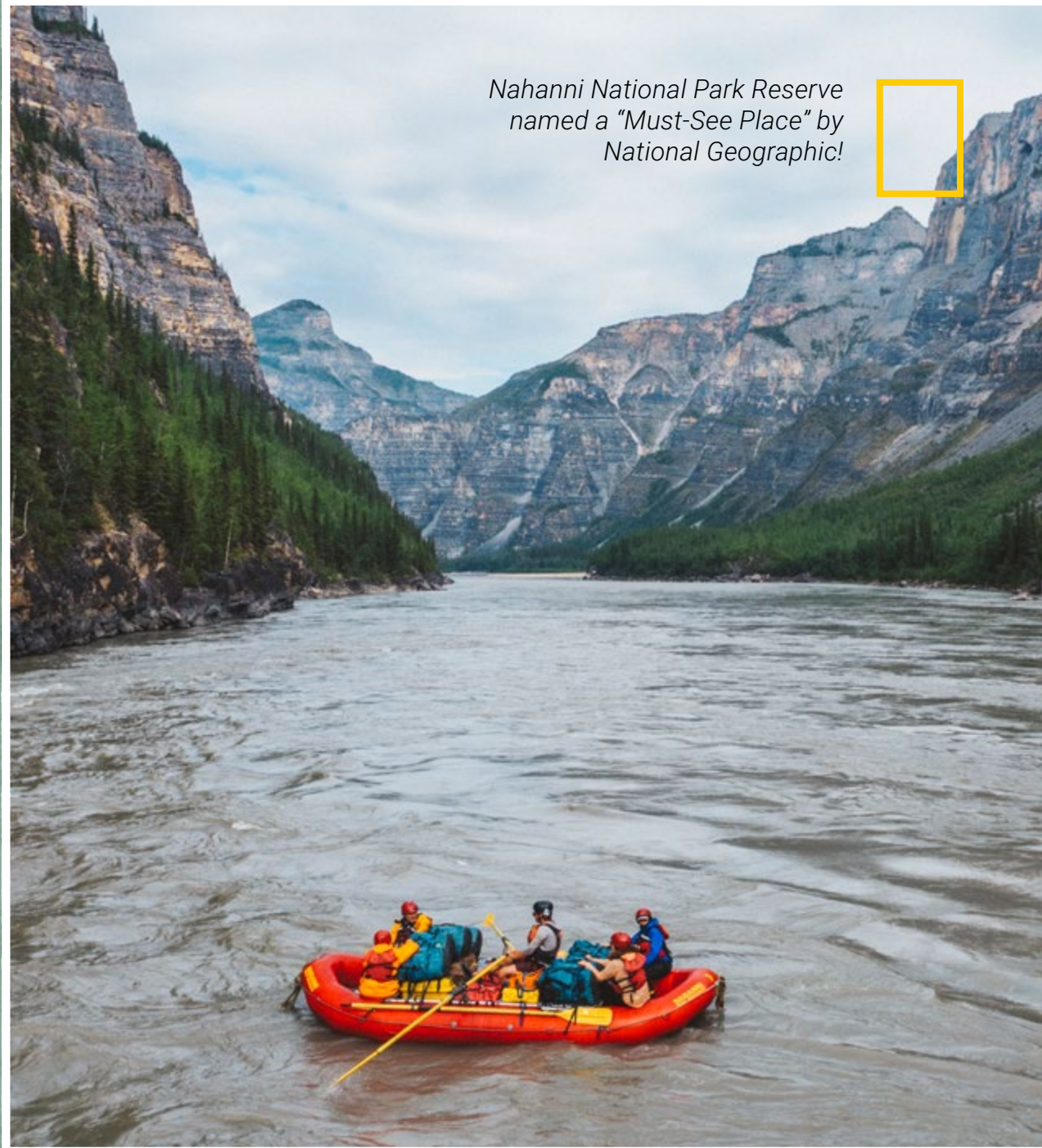
Float through the Nahanni River's Canyon Kingom, Canada's deepest canyon system.