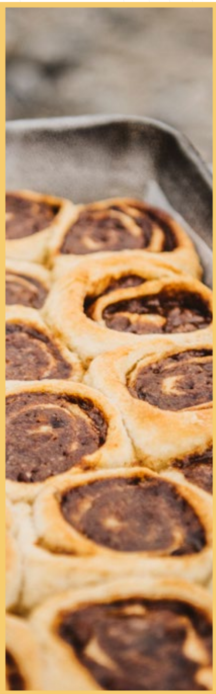
Fresh baking and a great cup of coffee to start the day...