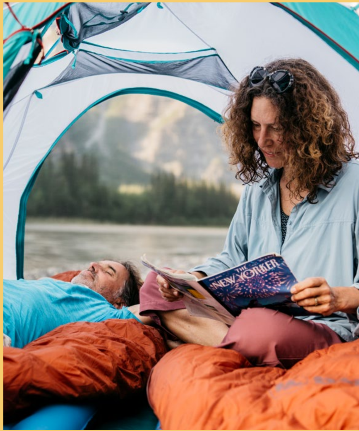
A river journey is comfortable, approachable and rejuvenating!