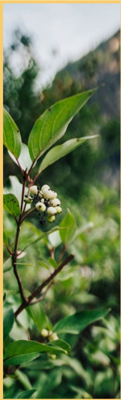
The North is a vibrant land full of life.