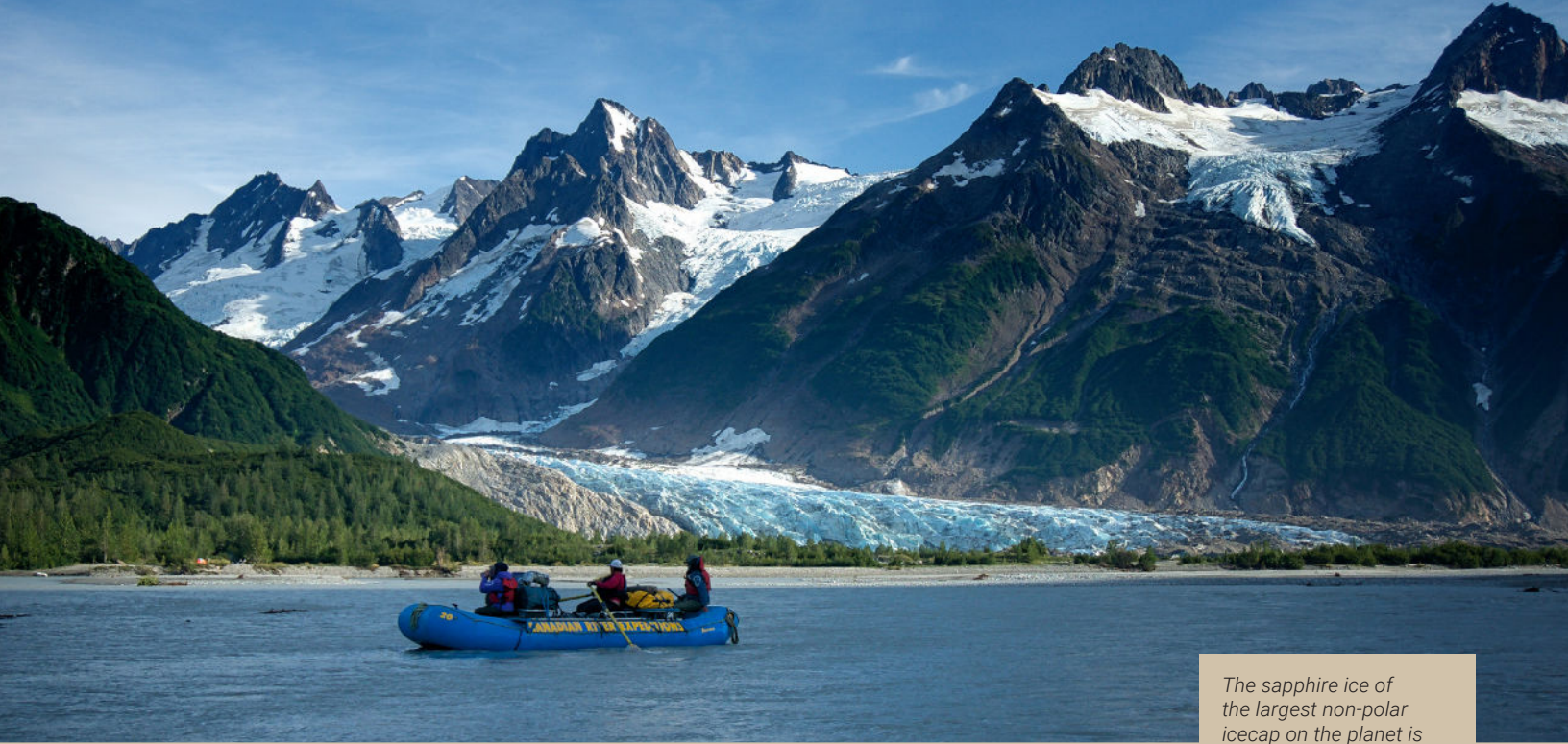
The sapphire ice of the largest non-polar icecap on the planet is a constant companion on the Alsek River. Walker Glacier, Glacier Bay National Park and Preserve, Alaska