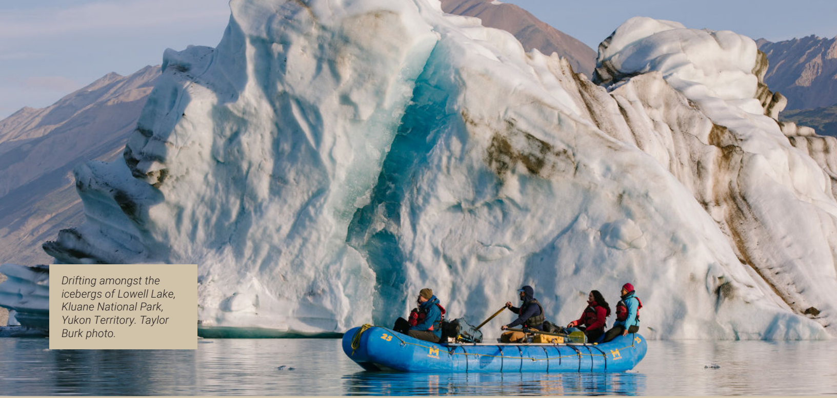
Drifting amongst the icebergs of Lowell Lake, Kluane National Park, Yukon Territory.