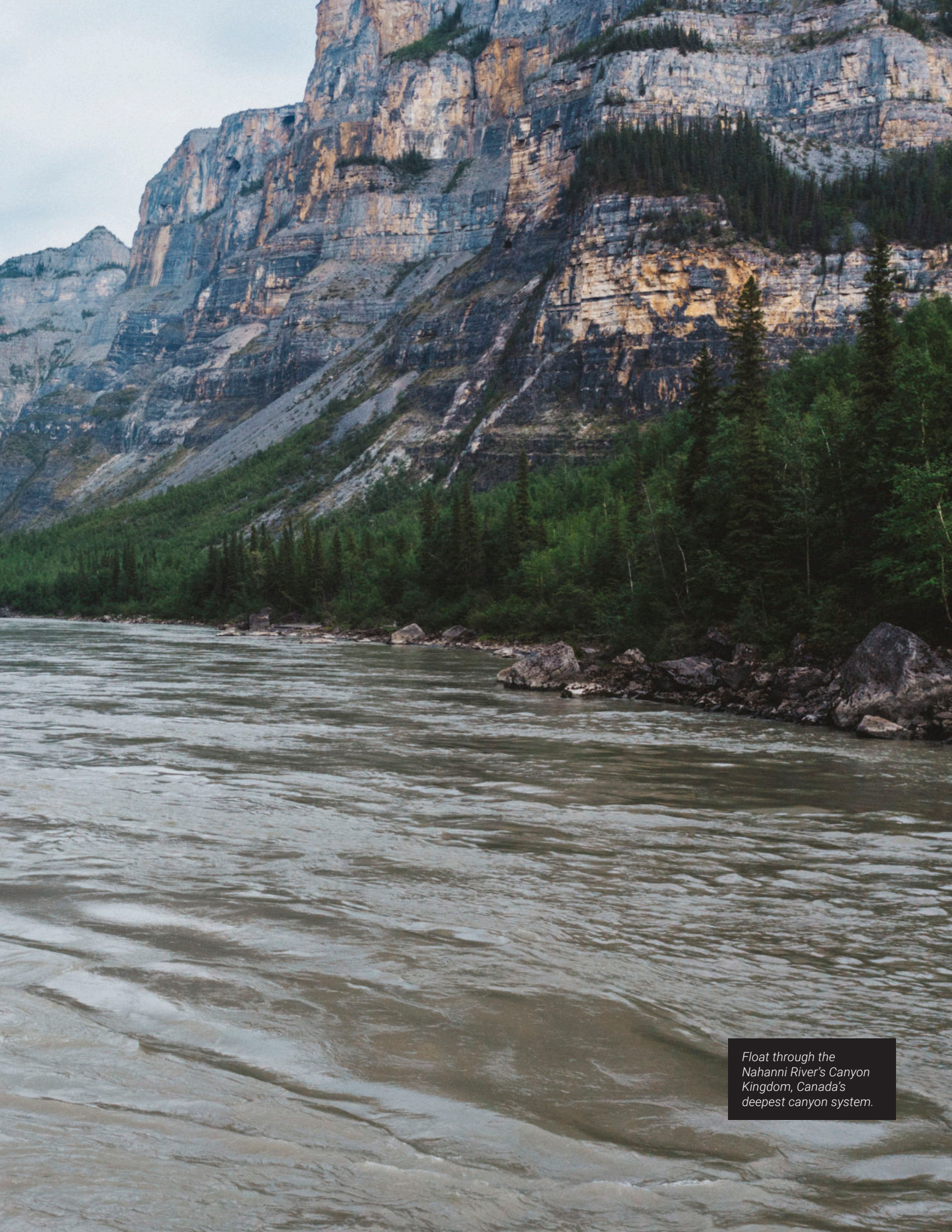
Float through the Nahanni River's Canyon Kingdom, Canada's deepest canyon system.