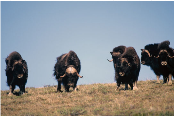
The primaeval musk ox can be found on trips to the Arctic tundra.