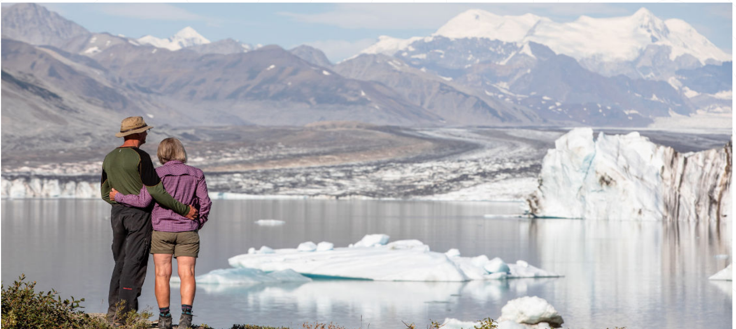
Shared moments create the memories that last forever.