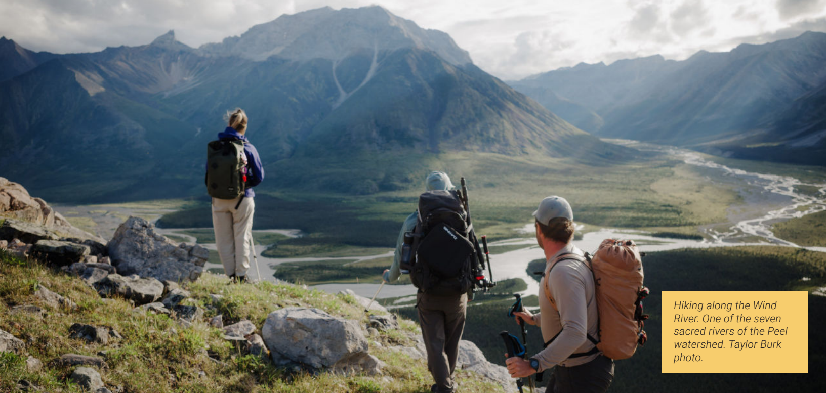
Hiking along the Wind River. One of the seven sacred rivers of the Peel watershed.