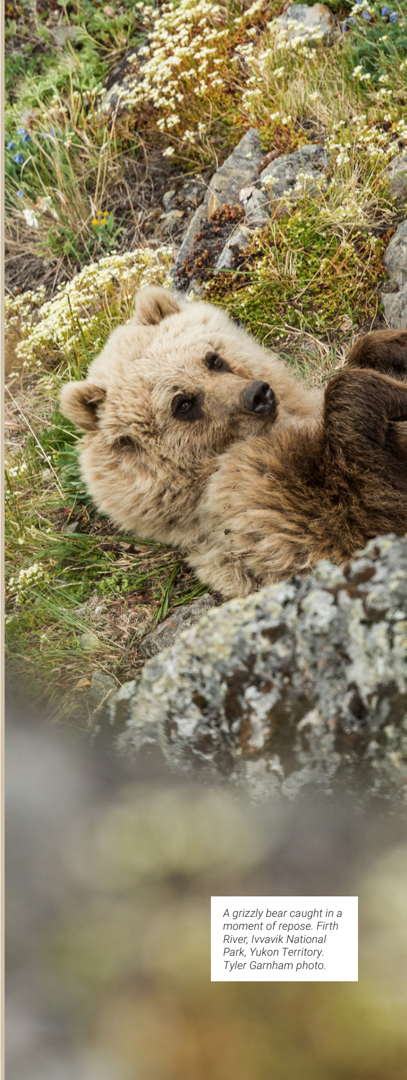
A grizzly bear caught in a moment of repose. Firth River, Ivvavik National Park, Yukon Territory.