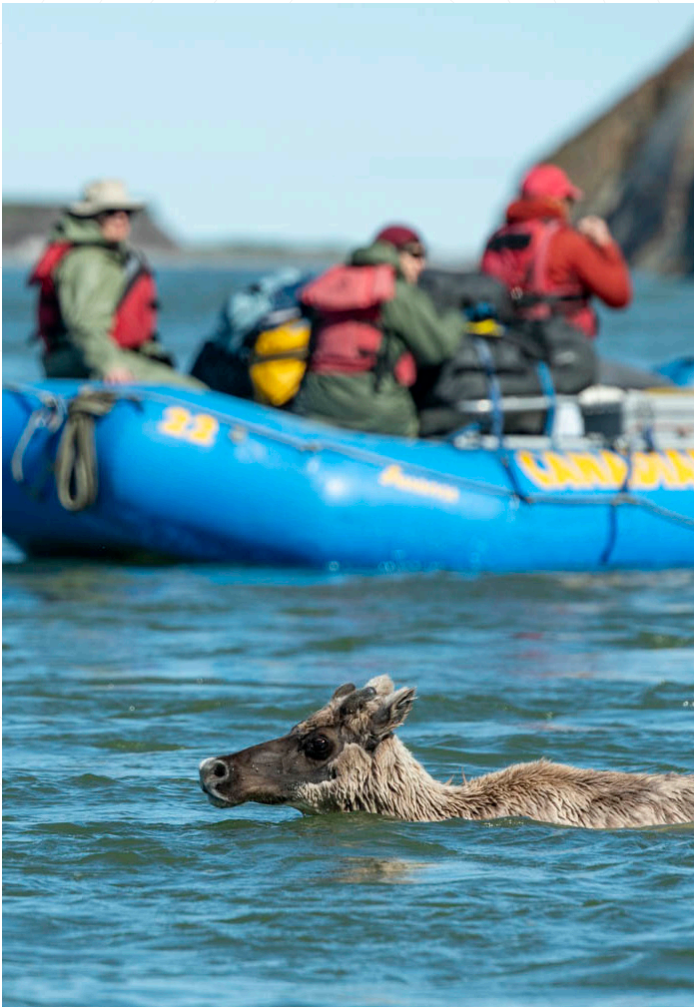
A calf, part of the Porcupine caribou herd, swims across the Firth River, Ivvavik National Park, Yukon Territory.

USD $13,250 / $13,730 (Parks Canada) +5% GST & $170 Park Fee