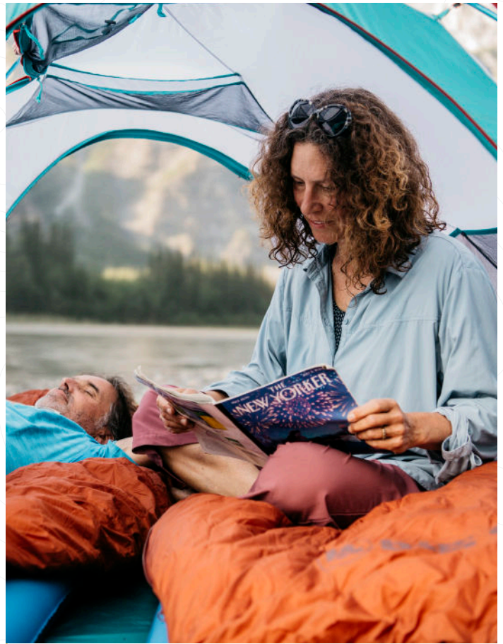
A river journey is comfortable, approachable and rejuvenating!

After meeting your guides and fellow travellers at the rendezvous point, you will make your way to the river. This usually requires a charter aircraft to fly in, out, or both. The flights take you over truly spectacular wilderness. Have your camera handy for the flight! Past participants have stepped off the plane declaring that "if the trip finished now, I would have my money's worth!"