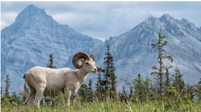
A mountain monarch, the Dalls Sheep ram is a magnificent presence in the Seven Sacred Rivers of the Peel Watershed.