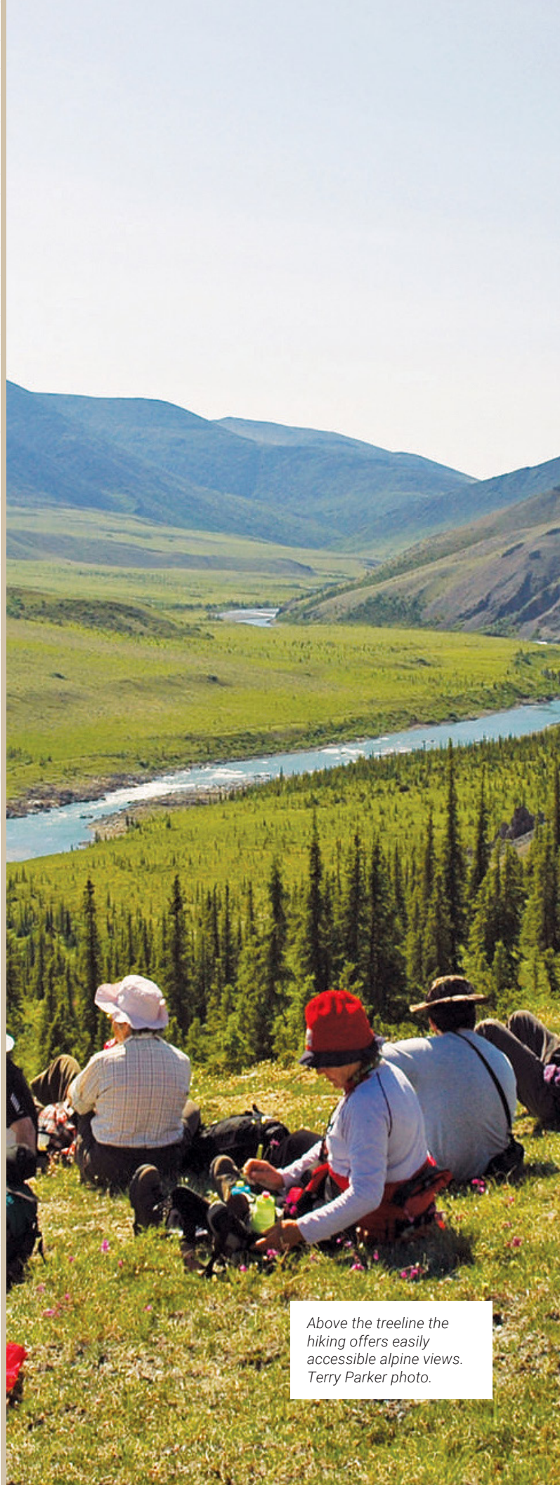
Above the treeline the hiking offers easily accessible alpine views.