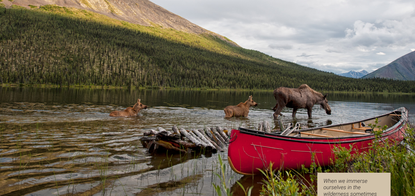
When we immerse ourselves in the wilderness sometimes the neighbours come to visit. Wind River, Yukon.