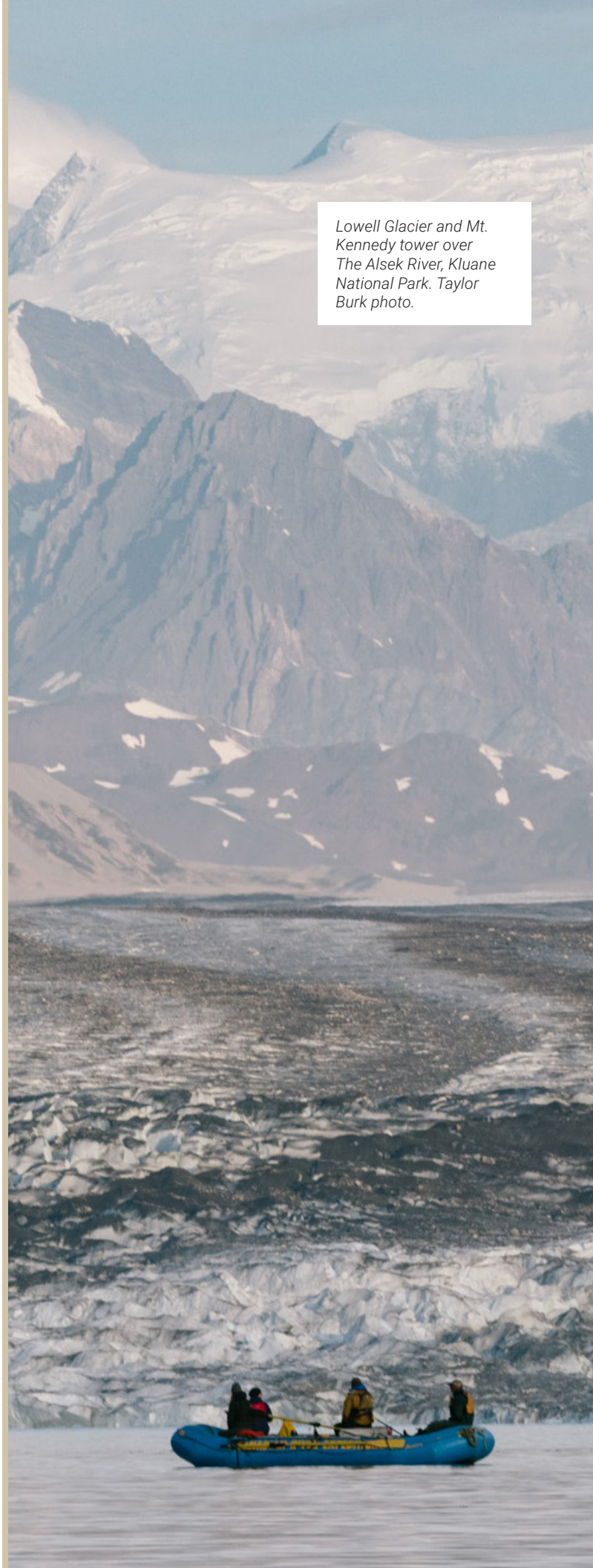
Lowell Glacier and Mt. Kennedy tower over The Alsek River, Kluane National Park.

Imagine yourself floating and hiking through the world's largest non-polar ice cap and bio-preserve. Alsek River, Glacier Bay National Park and Preserve, Alaska.