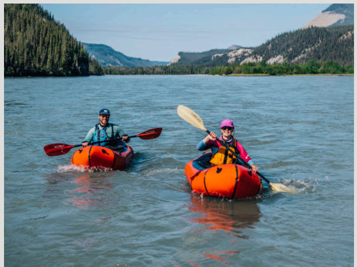
Packrafts offer a chance to explore on your own terms.

Travel Insurance: You are about to embark on a journey to some of the most remote, wilderness areas on earth! We encourage all our guests to purchase trip interruption, trip cancellation and emergency medical insurance at the time of booking. Proper insurance will ensure your investment in your wilderness journey is protected.