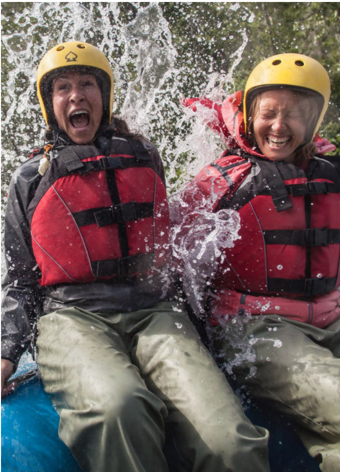
Feel the joy of shared moments in a wild land.