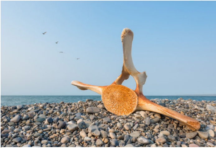
Discoveries abound on Nuneluk Spit, bowhead whale vertebrae in Ivvavik National Park, Yukon Territory.