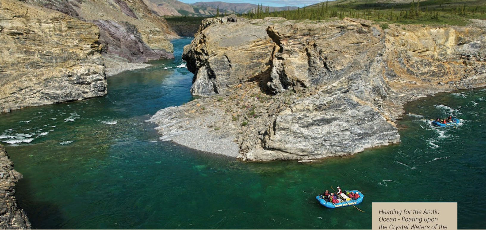
Heading for the Arctic Ocean - floating upon the Crystal Waters of the Firth River Canyon after a day full of hiking and wildlife viewing. Firth River, Ivvavik National Park, Yukon.