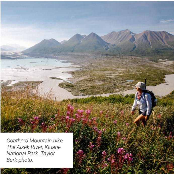
Goatherd Mountain hike. The Alsek River, Kluane National Park. Taylor Burk photo.

Imagine yourself floating and hiking through the world's largest non-polar ice cap and bio-preserve. Alsek River, Glacier Bay National Park and Preserve, Alaska. Taylor Burk photo.