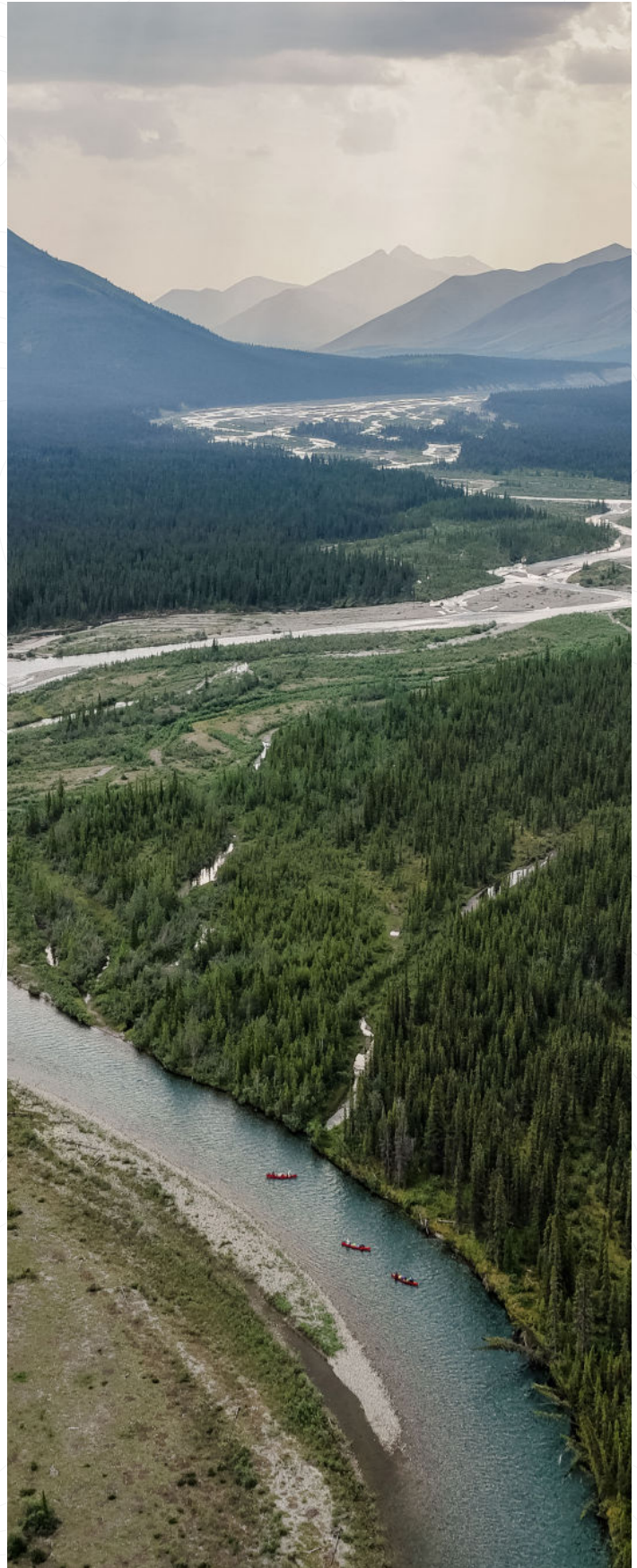
The North is a vibrant land full of life.

Finally, it will be time to settle into your tent for the night. Perhaps it's the soothing sound of the river flowing by, the active river lifestyle, or the carefree head space afforded by wilderness, but having a good night sleep is amazingly common.