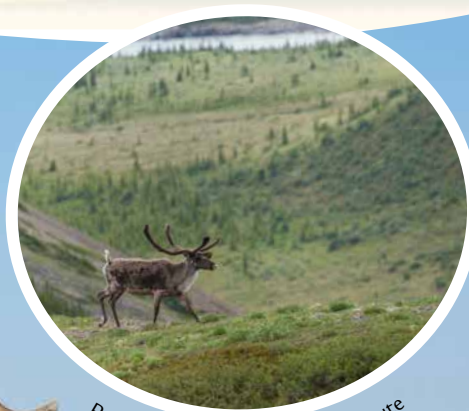
Porcupine Caribou migration route

Join this journey of discovery with an experienced team of Parks Canada's science and cultural staff and our senior river guides.