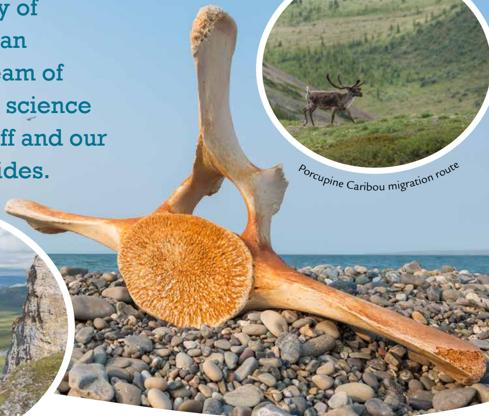
Beluga vertebrae, Beaufort Sea, Arctic Ocean