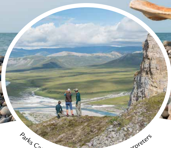
Parks Canada Scientists and Cultural Interpreters