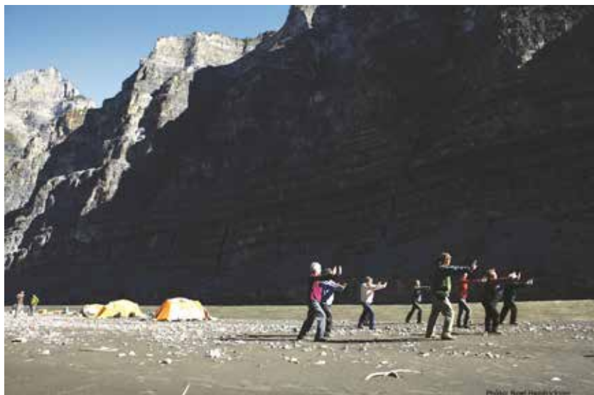
Camp in First Canyon - Nahanni's deepest.