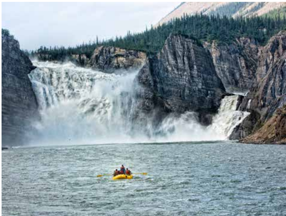
Virginia Falls-nearly twice the size of Virginia Falls.