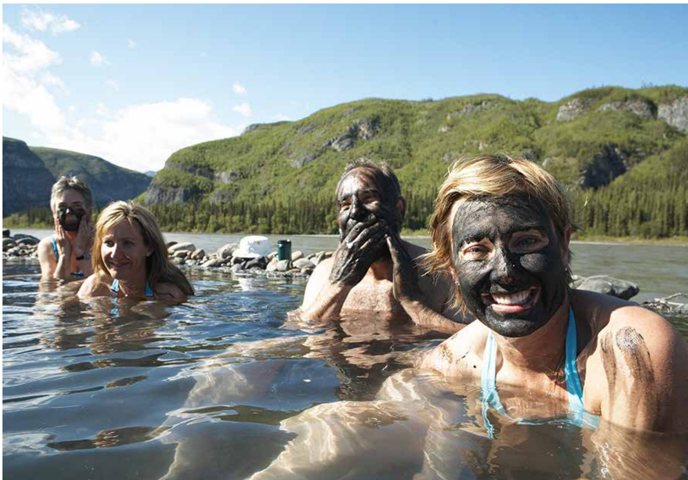
Kraus' Hotsprings "spa treatment" – Nahanni National Park and UNESCO World Heritage Site.