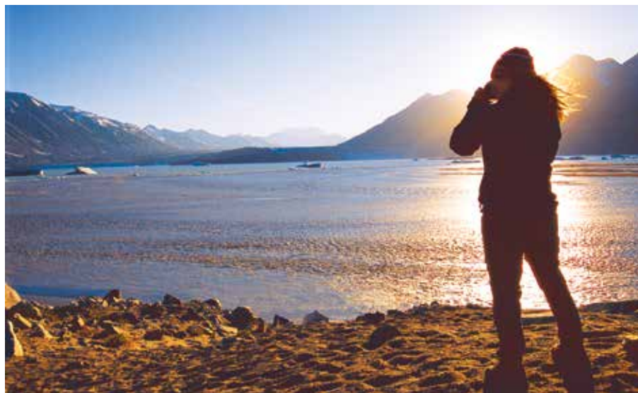
The Lowell glacier under the midnight sun on Lowell Lake.