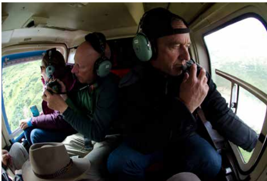
The helicopter flight over Tweedsmuir Glacier and Turnback Canyon is a highlight of every trip.

of which graze the slopes right above camp. Ptarmigan, horned larks and pipits nest and feed in the high country. Golden eagles soar over the slopes looking for unwary Arctic ground squirrels. A rainbow of wildflowers carpets the alpine meadows. The guides will split up to accompany some to the top of the plateau, others to the lower flanks and meadows and still others, for a ramble along the gentle iceberg-studded shoreline of Lowell Lake.