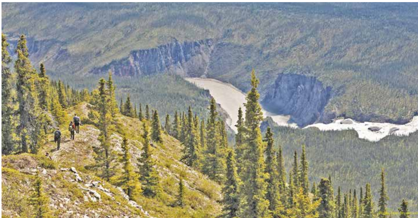
Hiking Sunblood Mountain overlooking Virginia Falls